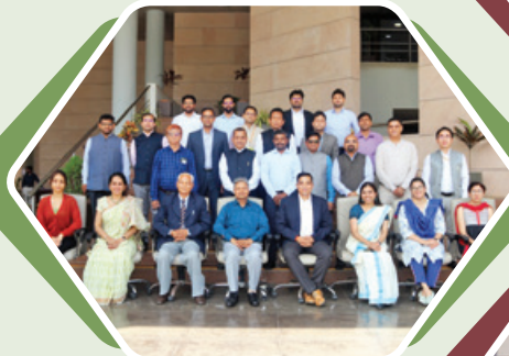
Visit to NFSU, Gandhinagar