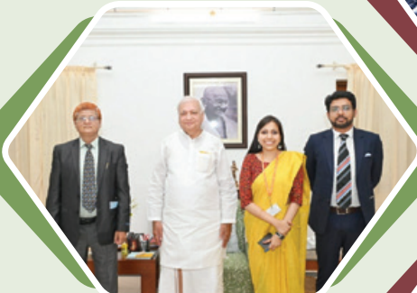
Calls on Hon'ble Governor of Kerala