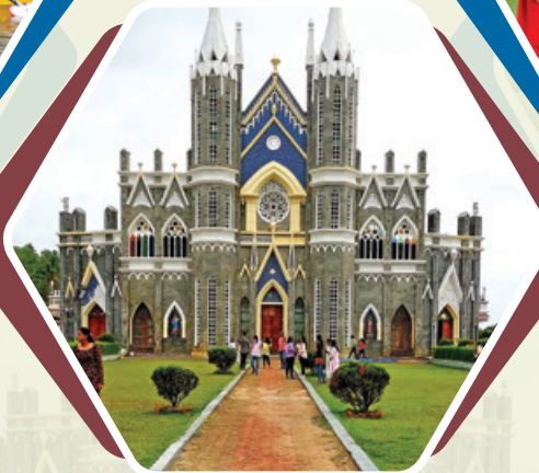
'Incredible India' through the eyes of IFS OTs during their Bharat Darshan