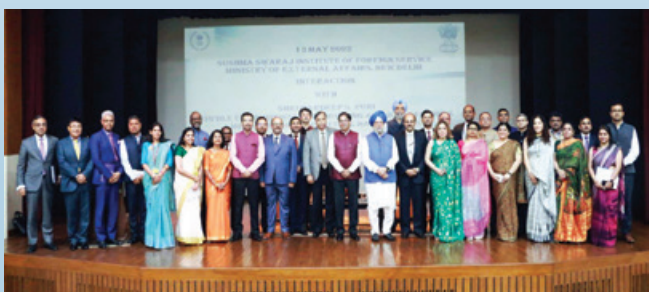
Address by Shri Hardeep Singh Puri, Minister for Petroleum & Natural Gas and Minister of Housing & Urban Affairs