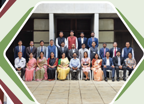
Visit to IIM Ahmedabad