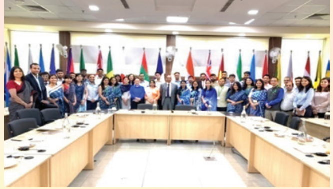
Visit to International Solar Alliance (ISA)