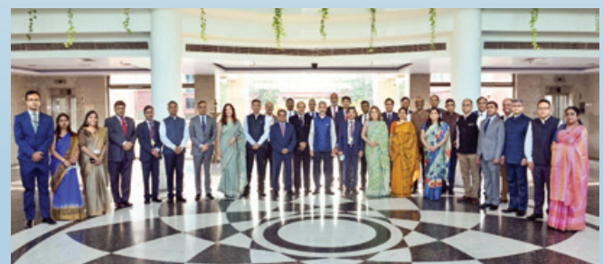
Call on External Affairs Minister, Dr. S. Jaishankar