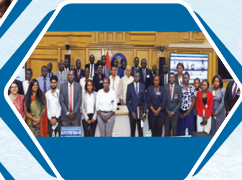
Visit to Election Commission of India