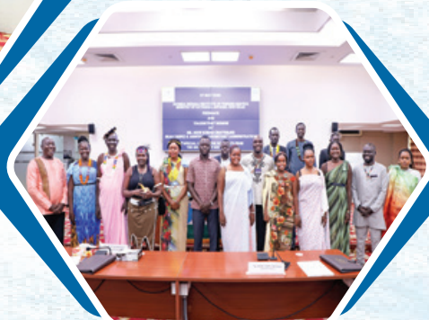
Diplomats from South Sudan in traditional attire