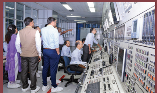
Visit to Department of Atomic Energy, Tarapur Atomic Power Station & Tata Memorial Hospital by IFS OTs