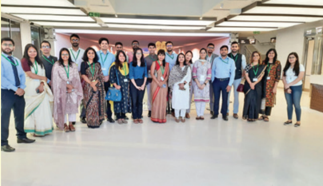
Visit to Pradhanmantri Sangrahalaya