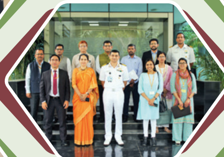
Visit to IFC-IOR