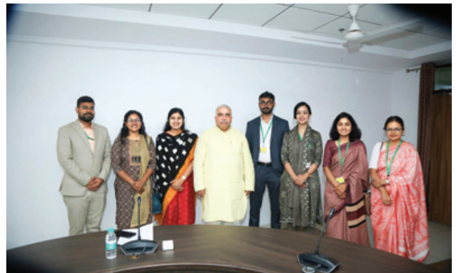
Call on dignitaries during State Attachments (Governors, Chief Ministers & senior officials) by IFS OTs