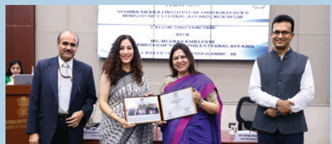
Smt. Meenakshi Lekhi, Minister of State for External Affairs & Culture, graced the Valedictory Ceremony