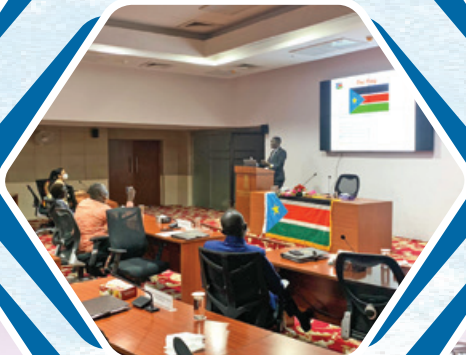
Country presentation by diplomats from South Sudan