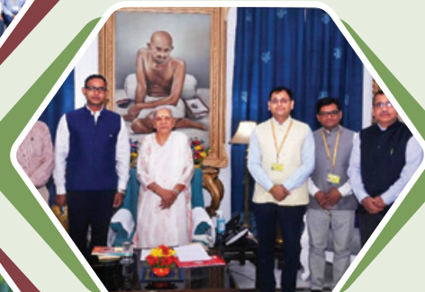
Calls on Hon'ble Governor of Uttar Pradesh