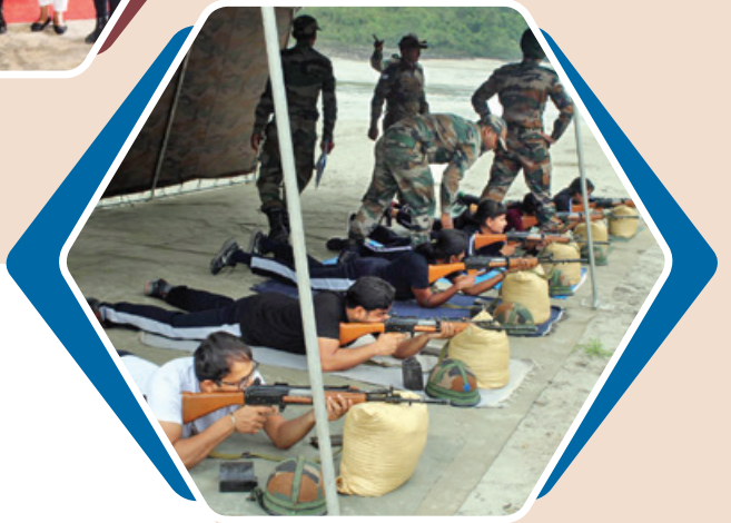
Army Attachment of IFS OTs