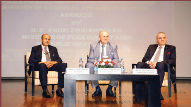
H.E. Mr. Zbigniew Rau, Foreign Minister of Poland visited SSIFS on 25 April 2022 and addressed the IFS OTs and Bhutanese diplomats.