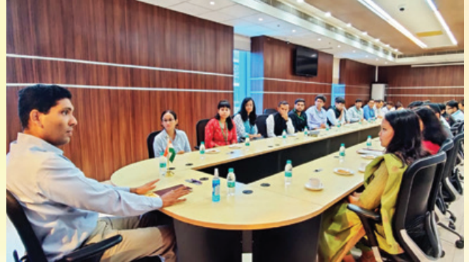
Visit to Regional Passport Office, Mumbai