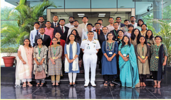
Visit to Information Fusion Centre-IOR