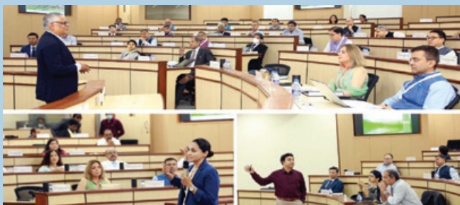
Visit to Indian School of Business, Hyderabad