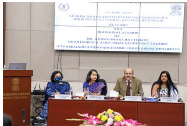
Inaugural session addressed by Dean (SSIFS)