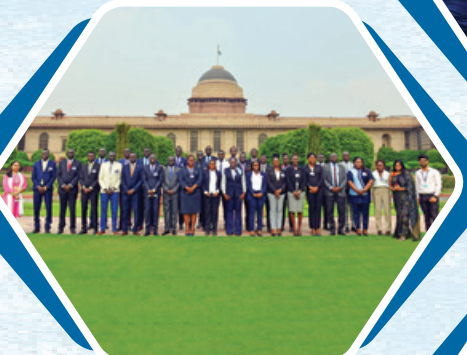
Visit to Rashtrapati Bhavan